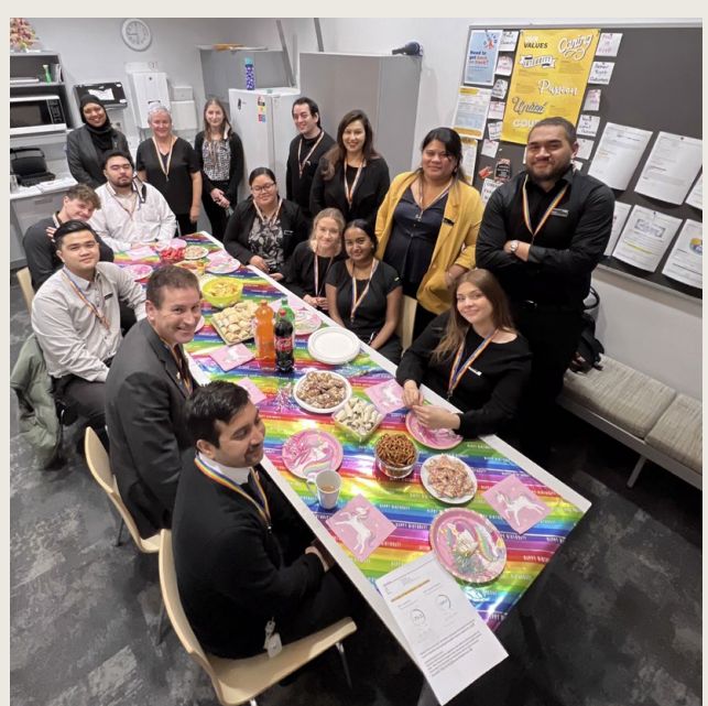
ASB was a finalist in the Inclusive Workplace category at the 2022 Diversity Awards NZ™